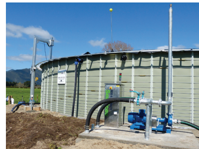
Submersible Stirrer and Above Ground Lifting Frame on KlipTank.

Specifications are subject to change without notice