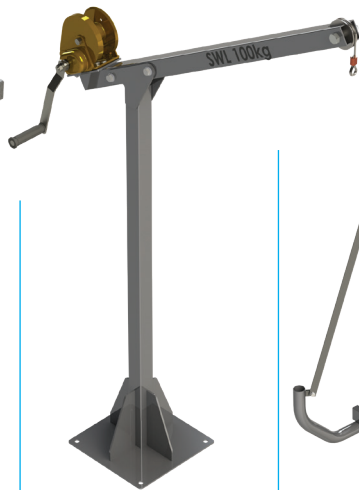
AYLF3000A Small Submersible Pump Lifting Frame Ground Mount