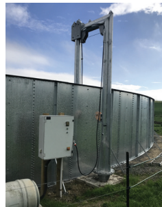
Submersible Stirrer and Over the Wall Stirrer Frame on Tasman Tank.