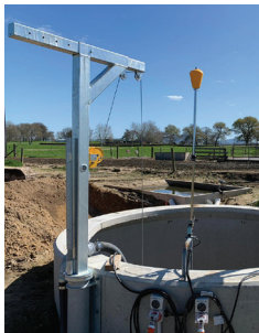
Submersible Pump and Lifting frame on Sump application.