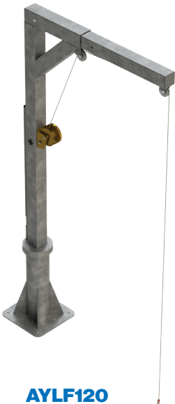
AYLF120 Submersible Pump Lifting Frame Ground Mount