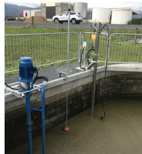
Submersible Stirrer and Lifting frame on Sump application.