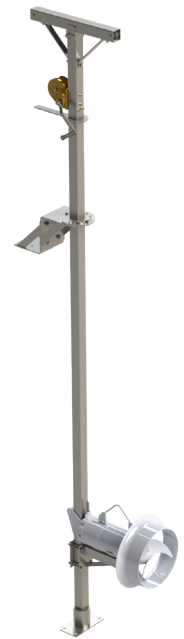
SSFS030SS Submersible Stirrer SS Lifting Frame In ground