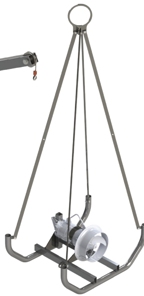
SSF15 Submersible Stirrer Sledge